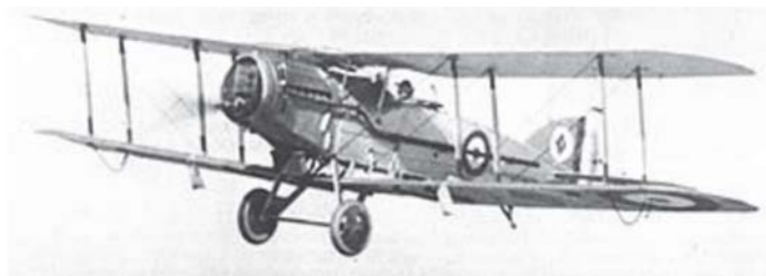
Aces and Aircraft of World War I, 2007, The Aerodrome. Bristol F.2B Fighter. Retrieved 20 March 2007, from http://www.theaerodrome.com/aircraft/gbritain/bristol_f2b.php