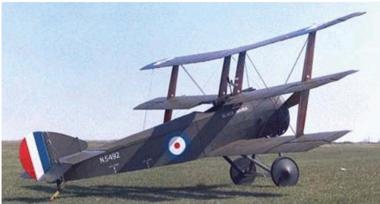
Aviation History, The Sopwith Triplane – Great Britain. (2006). The Aviation History On-Line Museum. Retrieved 20 March 2007, from http://www.aviation-history.com/sopwith/triplane.htm