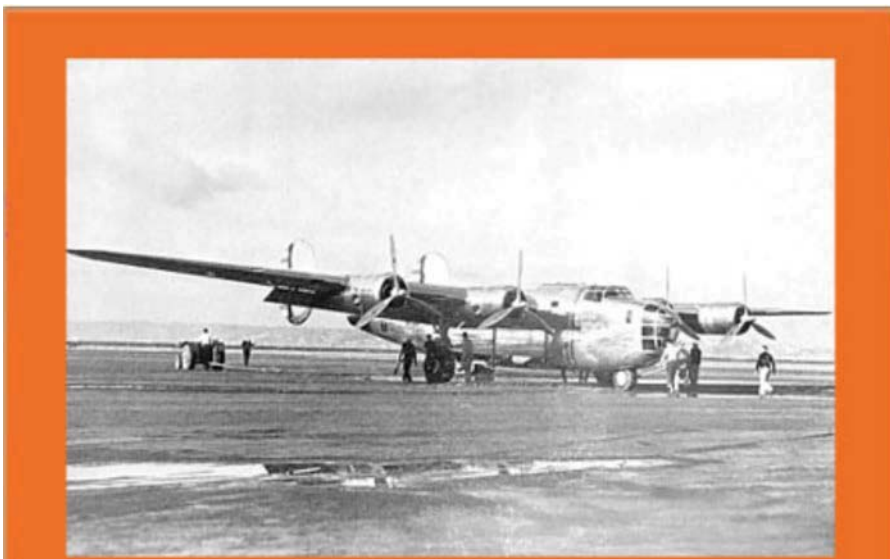
"Consolidated B-24 Liberator Bomber", Beehive Hockey Photos (2006). Retrieved 20 March 2007, from http://www.beehivehockey.com/photo_18liberator.htm